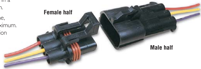
Typical three straight contact configuration